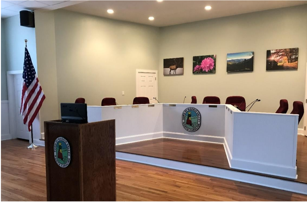
TOWN OF MAGGIE VALLEY ANNUAL NEWSLETTER